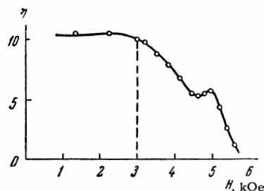
FIG. 3. Amplification of proton polarization vs. magnetic field intensity in a crystal with 0.2% Ce^{3+} at a saturation frequency 165 Mcs at a rotation speed f = 250 rpm.

The presence of a maximum at \nu_e^S = \nu_{e \min} - \nu_n was predicted above in the case when there is no inversion of the levels and there is rapid passage